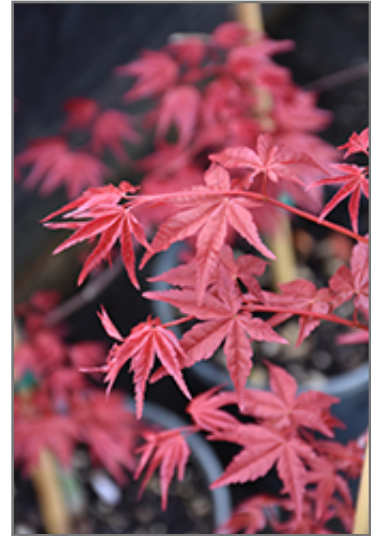
Bonfire Japanese Maple foliage

Bonfire Japanese Maple is recommended for the following landscape applications;