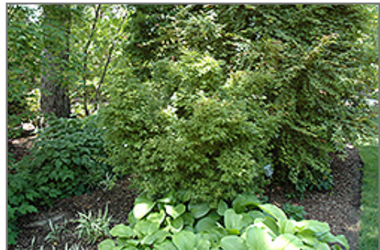
Bonfire Japanese Maple