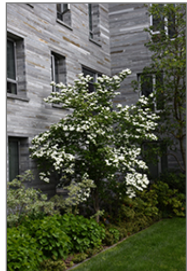
Constellation Flowering Dogwood in bloom