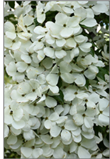
Constellation Flowering Dogwood flowers

Constellation Flowering Dogwood is recommended for the following landscape applications;