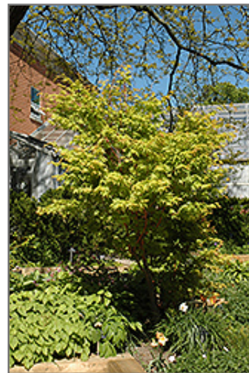
Coral Bark Japanese Maple