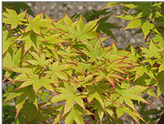
Coral Bark Japanese Maple foliage

This is a relatively low maintenance tree, and should only be pruned in summer after the leaves have fully developed, as it may 'bleed' sap if pruned in late winter or early spring. It has no significant negative characteristics.