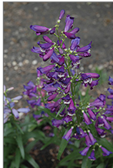
Blue Midnight Beard Tongue flowers