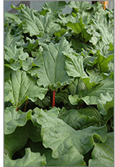
Canada Red Rhubarb

Canada Red Rhubarb features bold spikes of white flowers rising above the foliage from early to mid summer. Its enormous crinkled round leaves remain green in colour throughout the season. The cherry red stems are very colorful and add to the overall interest of the plant.