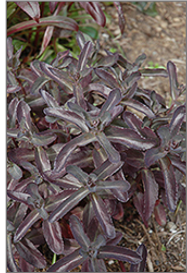
Postman's Pride Stonecrop

Postman's Pride Stonecrop is recommended for the following landscape applications;