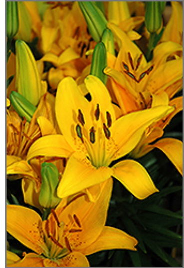
Lily Looks Tiny Bee Lily flowers