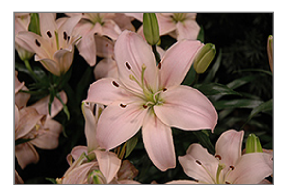
Lily Looks Tiny Athlete Lily flowers