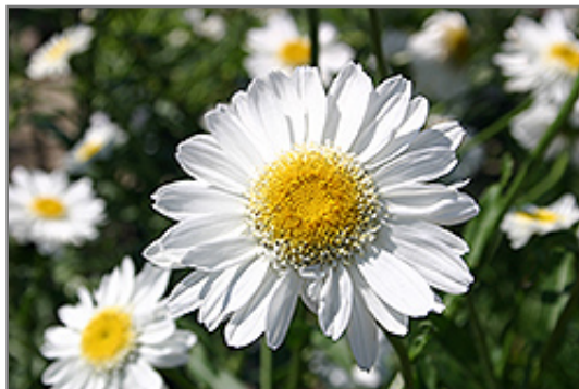
Sunny Side Up Shasta Daisy flowers