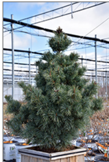
Bergman Japanese White Pine

This tree should only be grown in full sunlight. It prefers dry to average moisture levels with very well-drained soil, and will often die in standing water. It is considered to be drought-tolerant, and thus makes an ideal choice for xeriscaping or the moisture-conserving landscape. It is not particular as to soil type or pH, and is able to handle environmental salt. It is somewhat tolerant of urban pollution. This is a selected variety of a species not originally from North America.