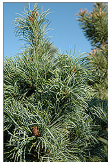
Bergman Japanese White Pine foliage