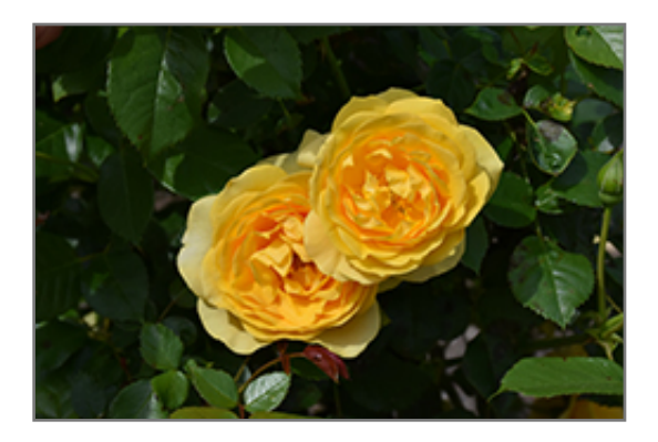
Julia Child Rose flowers

A lovely and even buttery gold coloring, and the licorice candy fragrance compliment the perfectly rounded habit, superior glossy leaves, and great disease resistance of this exceptional variety