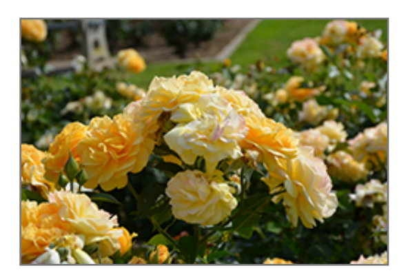
Julia Child Rose flowers

This shrub will require occasional maintenance and upkeep, and is best pruned in late winter once the threat of extreme cold has passed. Gardeners should be aware of the following characteristic(s) that may warrant special consideration;