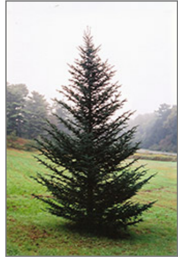
Fraser Fir