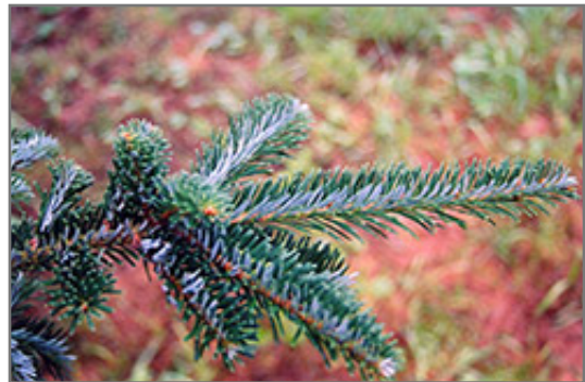
Fraser Fir foliage