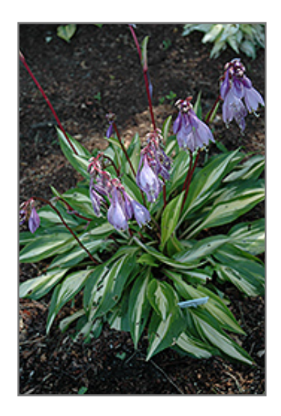
Cherry Berry Hosta in bloom

Cherry Berry Hosta is recommended for the following landscape applications;