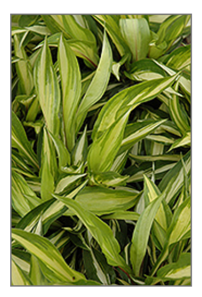
Cherry Berry Hosta foliage