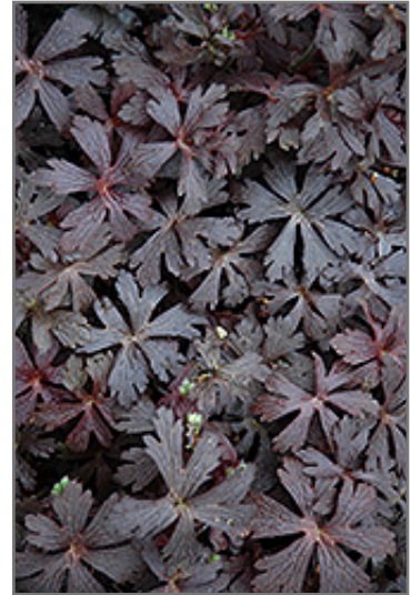
Espresso Cranesbill foliage

This plant will require occasional maintenance and upkeep, and should only be pruned after flowering to avoid removing any of the current season's flowers. Deer don't particularly care for this plant and will usually leave it alone in favor of tastier treats. Gardeners should be aware of the following characteristic(s) that may warrant special consideration;