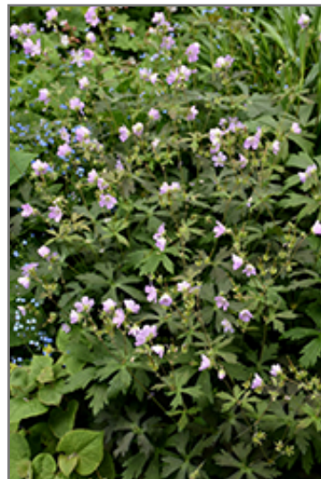
Espresso Cranesbill in bloom

Espresso Cranesbill is a fine choice for the garden, but it is also a good selection for planting in outdoor pots and containers. It is often used as a 'filler' in the 'spiller-thriller-filler' container combination, providing a mass of flowers and foliage against which the thriller plants stand out. Note that when growing plants in outdoor containers and baskets, they may require more frequent waterings than they would in the yard or garden.