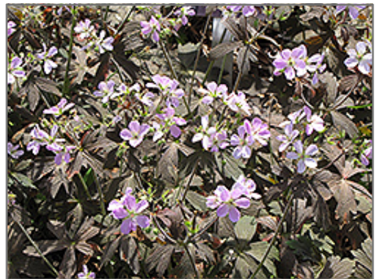
Espresso Cranesbill flowers