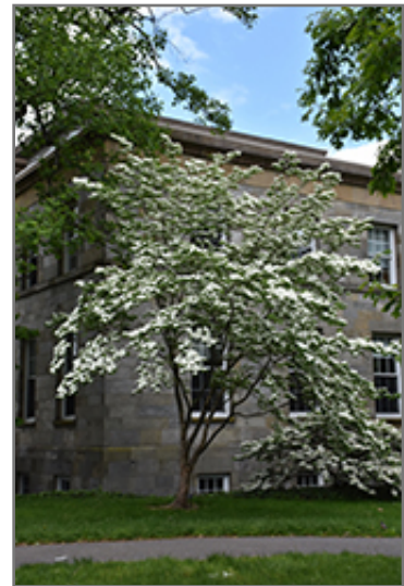
Celestial Flowering Dogwood in bloom