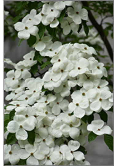
Celestial Flowering Dogwood flowers

Celestial Flowering Dogwood is recommended for the following landscape applications;