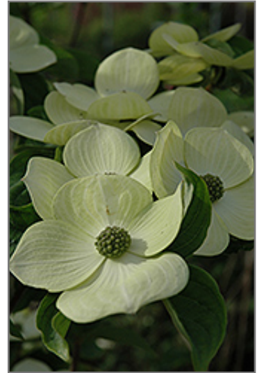
Celestial Flowering Dogwood flowers

This tree does best in full sun to partial shade. It does best in average to evenly moist conditions, but will not tolerate standing water. It is very fussy about its soil conditions and must have rich, acidic soils to ensure success, and is subject to chlorosis (yellowing) of the foliage in alkaline soils. It is somewhat tolerant of urban pollution, and will benefit from being planted in a relatively sheltered location. Consider applying a thick mulch around the root zone in winter to protect it in exposed locations or colder microclimates. This particular variety is an interspecific hybrid.