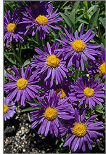
Dark Beauty Alpine Aster flowers