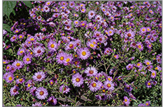
Woods Purple Aster flowers