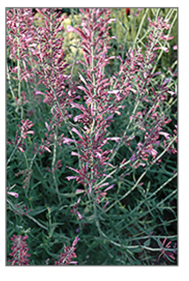
Pink Panther Hyssop flowers

Airy spikes of tubular magenta flowers, complement coarser textured perennials in the garden; attracts hummingbirds and other pollinators; aromatic, licorice scented, bronze-green foliage