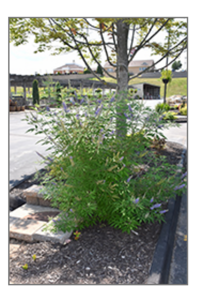
Chaste Tree in bloom

This shrub does best in full sun to partial shade. It is very adaptable to both dry and moist locations, and should do just fine under average home landscape conditions. It is considered to be drought-tolerant, and thus makes an ideal choice for xeriscaping or the moisture-conserving landscape. It is not particular as to soil type or pH, and is able to handle environmental salt. It is highly tolerant of urban pollution and will even thrive in inner city environments, and will benefit from being planted in a relatively sheltered location. This species is not originally from North America.