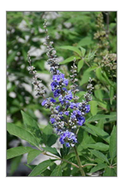
Chaste Tree flowers