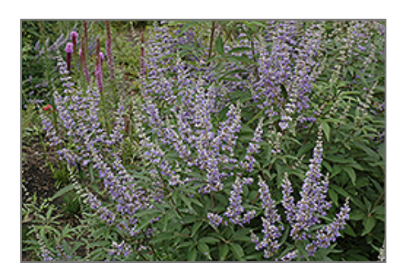
Chaste Tree flowers