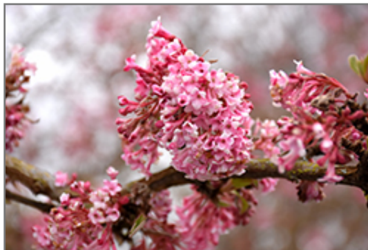
Dawn Viburnum flowers

Dawn Viburnum is recommended for the following landscape applications;