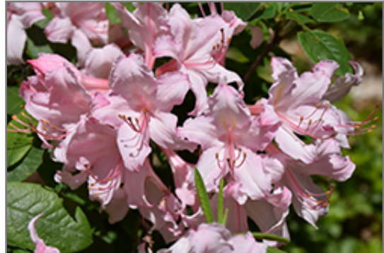
Candy Lights Azalea flowers

Candy Lights Azalea is recommended for the following landscape applications;