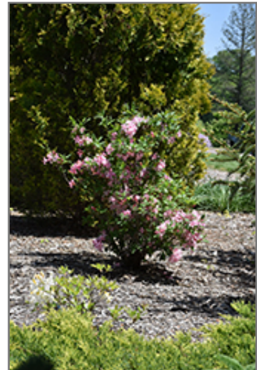
Candy Lights Azalea in bloom