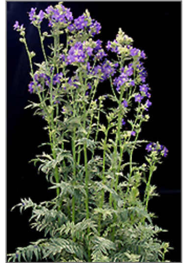
Snow And Sapphires Jacob's Ladder in bloom