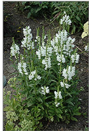
Miss Manners Obedient Plant in bloom