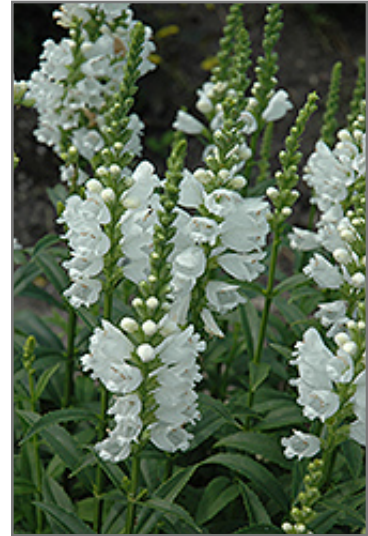
Miss Manners Obedient Plant flowers