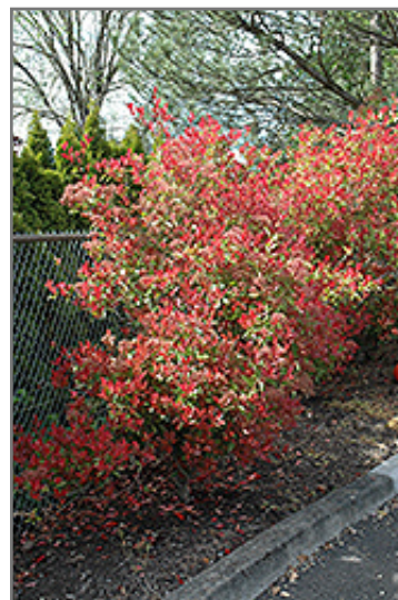
Fraser Photinia in bloom