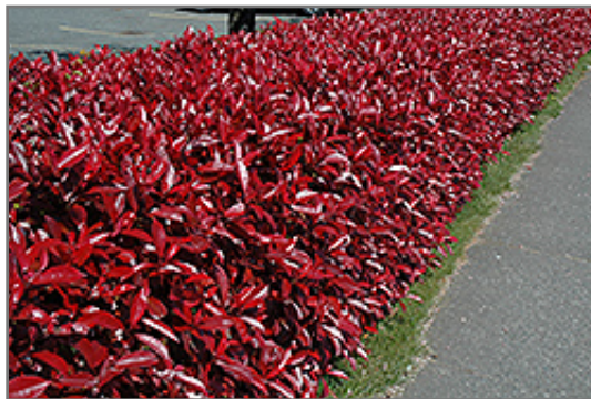
Fraser Photinia

This shrub performs well in both full sun and full shade. However, you may want to keep it away from hot, dry locations that receive direct afternoon sun or which get reflected sunlight, such as against the south side of a white wall. It is very adaptable to both dry and moist growing conditions, but will not tolerate any standing water. It is not particular as to soil type or pH. It is highly tolerant of urban pollution and will even thrive in inner city environments. This particular variety is an interspecific hybrid.