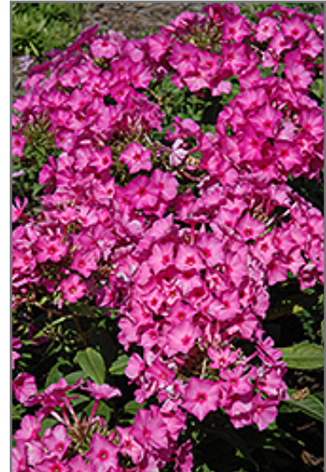
Flame Pink Garden Phlox flowers