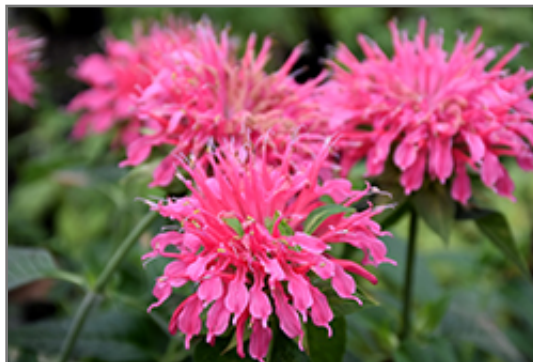
Coral Reef Beebalm flowers