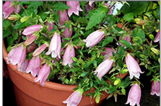
Pink Chimes Bellflower flowers