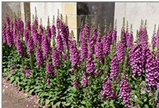
Camelot Rose Foxglove in bloom

This plant will require occasional maintenance and upkeep, and is best cleaned up in early spring before it resumes active growth for the season. It is a good choice for attracting hummingbirds to your yard, but is not particularly attractive to deer who tend to leave it alone in favor of tastier treats. Gardeners should be aware of the following characteristic(s) that may warrant special consideration;