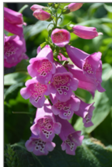
Camelot Rose Foxglove flowers