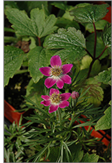
Cutleaf Anemone flowers