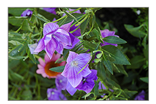
Hakone Blue Balloon Flower flowers