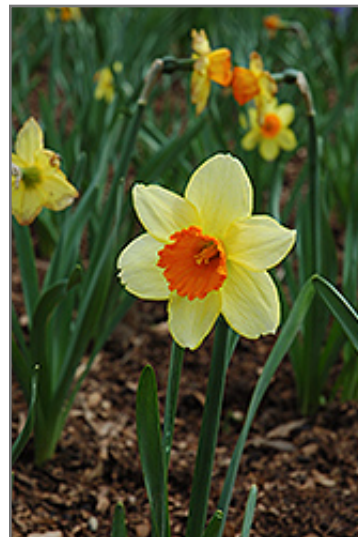
Fortissimo Daffodil flowers