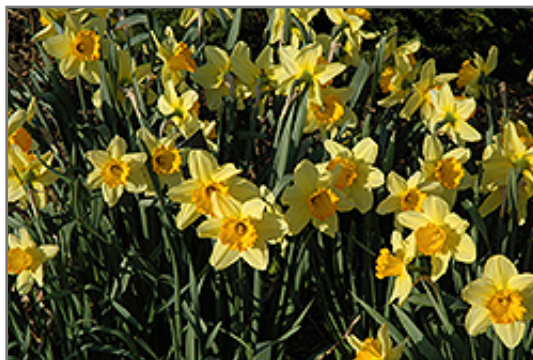
Fortissimo Daffodil flowers