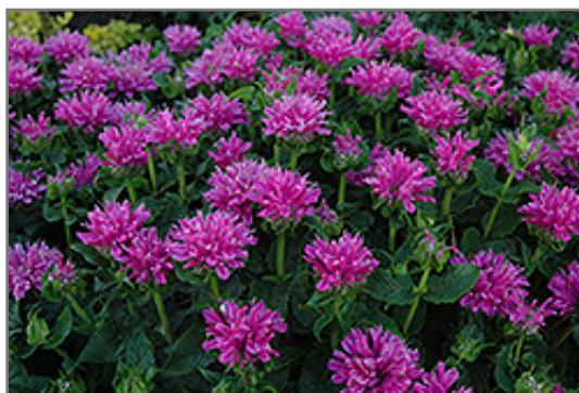
Petite Delight Beebalm flowers