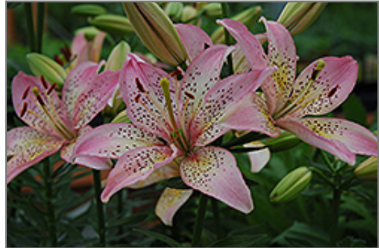
Pixie Lily flowers