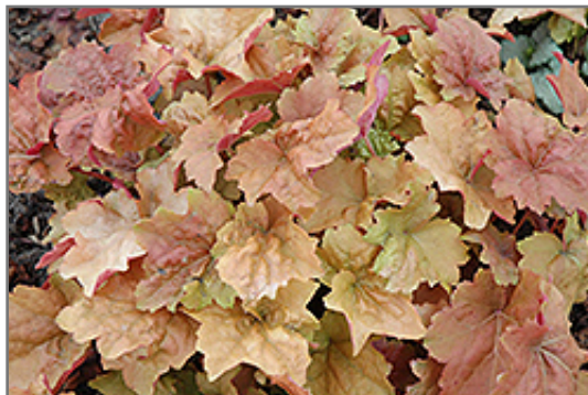
Dolce Creme Brulee Coral Bells foliage

This is a relatively low maintenance plant, and should be cut back in late fall in preparation for winter. It is a good choice for attracting hummingbirds to your yard. It has no significant negative characteristics.