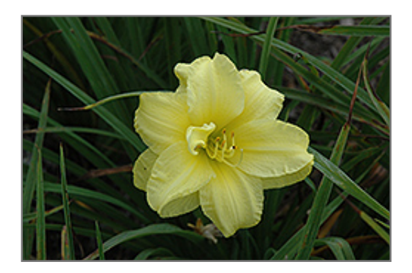
Double Cutie Daylily flowers