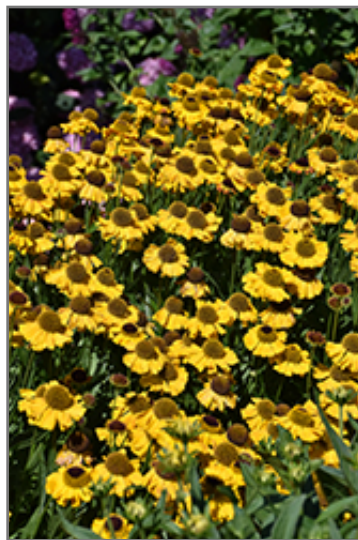
Wyndley Sneezeweed flowers