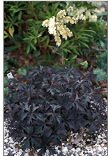
Victor Reiter Cranesbill foliage