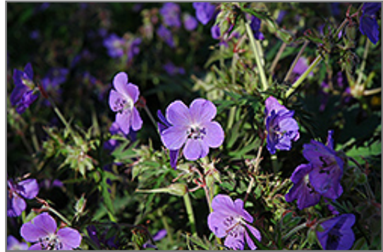
Victor Reiter Cranesbill flowers

This is a relatively low maintenance plant, and should only be pruned after flowering to avoid removing any of the current season's flowers. Deer don't particularly care for this plant and will usually leave it alone in favor of tastier treats. It has no significant negative characteristics.