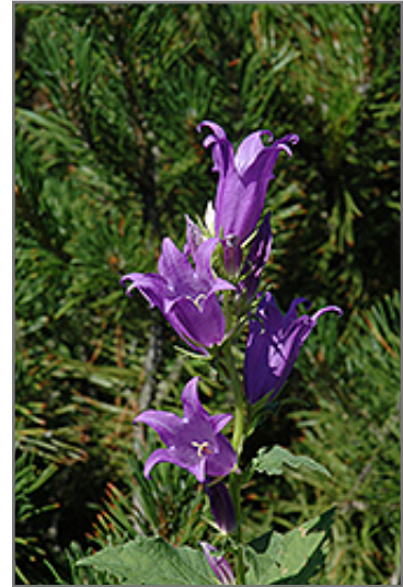
Spotted Bellflower flowers