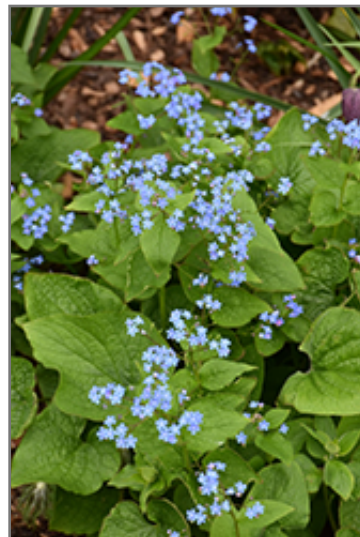
Siberian Bugloss flowers

Siberian Bugloss is recommended for the following landscape applications;