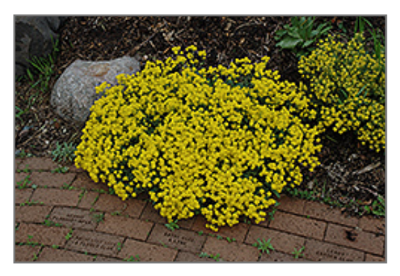
Gold Dust Basket Of Gold in bloom

Gold Dust Basket Of Gold is recommended for the following landscape applications;