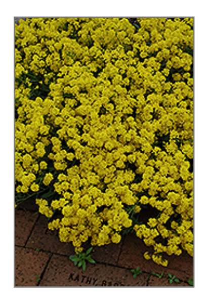
Gold Dust Basket Of Gold flowers

This is a relatively low maintenance plant, and is best cleaned up in early spring before it resumes active growth for the season. It is a good choice for attracting bees and butterflies to your yard. It has no significant negative characteristics.