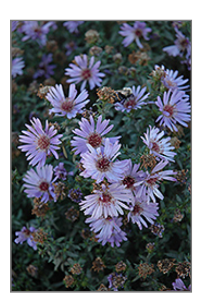
Woods Blue Aster flowers