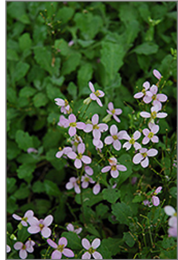
Pink Wall Cress flowers