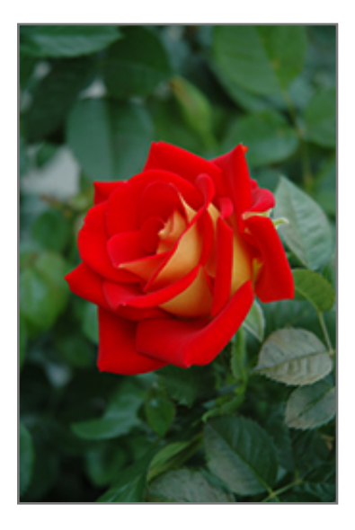
Ketchup And Mustard Rose flowers

Ketchup And Mustard Rose is recommended for the following landscape applications;