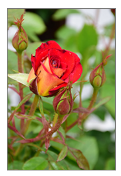
Ketchup And Mustard Rose flower buds