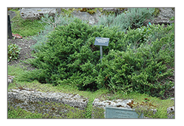
New Blue Tam Juniper

New Blue Tam Juniper is a dwarf conifer which is primarily valued in the garden for its broadly spreading habit of growth. It has attractive blue evergreen foliage which emerges powder blue in spring. The scale-like sprays of foliage are highly ornamental and remain blue throughout the winter. It produces blue berries from late spring to late winter.