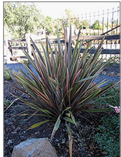
Rainbow Sunrise New Zealand Flax