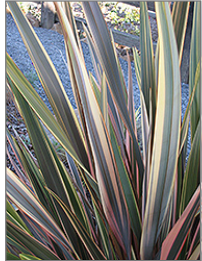
Rainbow Sunrise New Zealand Flax foliage

Rainbow Sunrise New Zealand Flax is recommended for the following landscape applications;