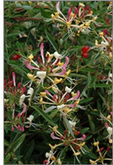
Sweet Tea Honeysuckle flowers