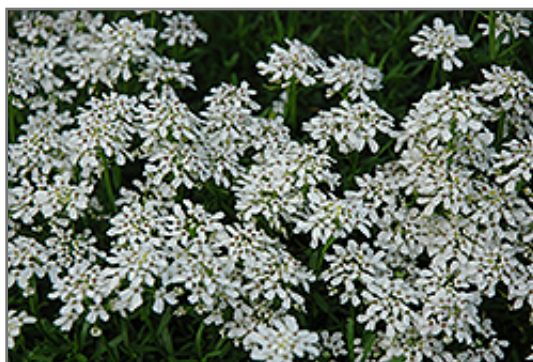
Little Gem Candytuft flowers