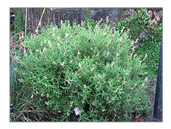
Lemon Leigh Lavender in bloom

This is a relatively low maintenance shrub, and can be pruned at anytime. It is a good choice for attracting bees and butterflies to your yard, but is not particularly attractive to deer who tend to leave it alone in favor of tastier treats. It has no significant negative characteristics.