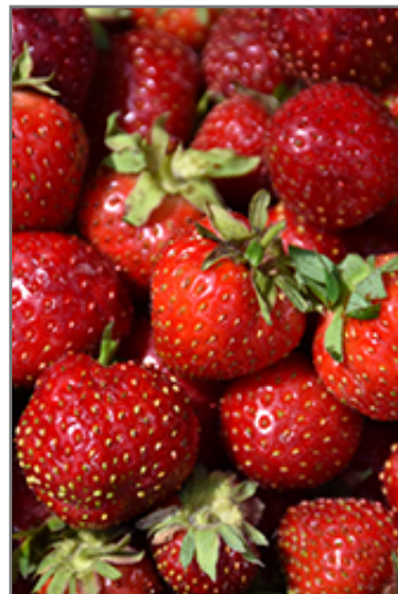
Quinault Strawberry fruit

Quinault Strawberry features dainty white cup-shaped flowers with lemon yellow eyes along the stems from mid spring to late summer. Its serrated round compound leaves remain dark green in colour throughout the season. It features an abundance of magnificent red berries from late spring to mid fall.