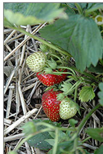
Quinault Strawberry fruit