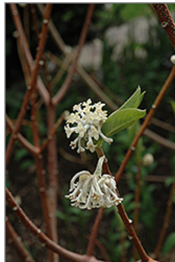
Oriental Paper Bush flowers

Oriental Paper Bush is recommended for the following landscape applications;